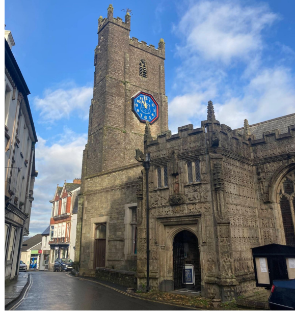
Launceston's St Mary Magdalene- Clock after

Architecture & Clocks is inspired by the refurbished clock at St Mary Magdalene, a very old listed church in Launceston, Cornwall - isn't it so much more colourful now!