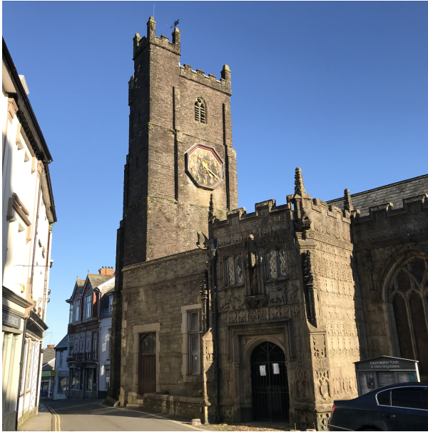
Launceston's St Mary Magdalene- Clock before